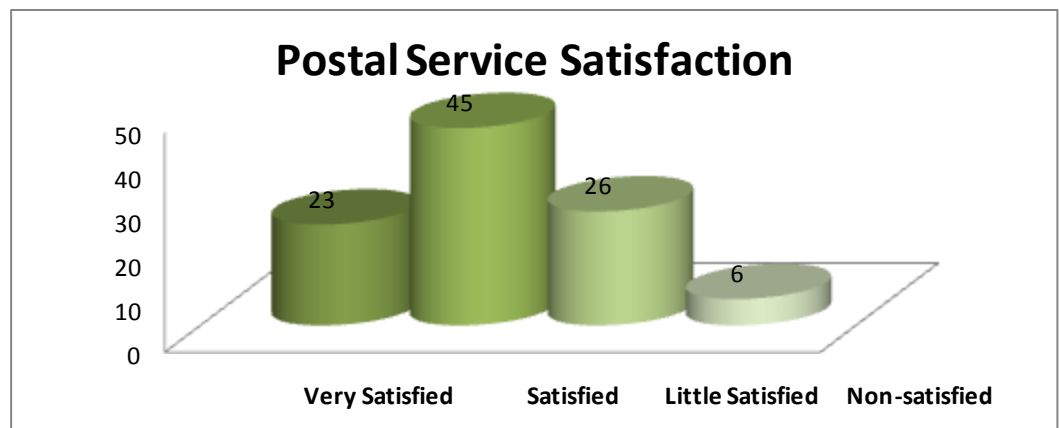
FIGURE 1 - ALBANIAN POSTAL SERVICES SATISFACTION