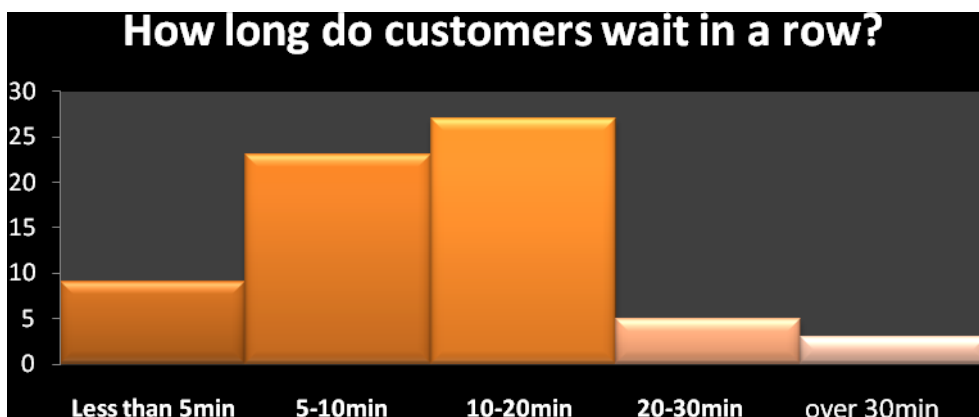
FIGURE 3 - HOW LONG DO CUSTOMERS WAIT IN A LINE?